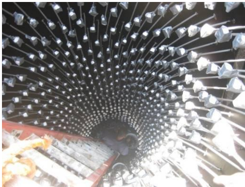
Anchor Studs with Styrofoam Cap installed And ready for Form